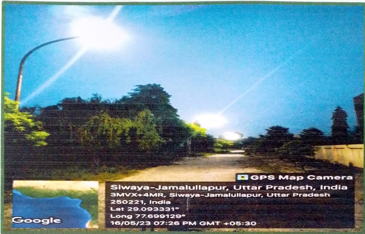
Photo sensor based LED street lights installed in the university campus