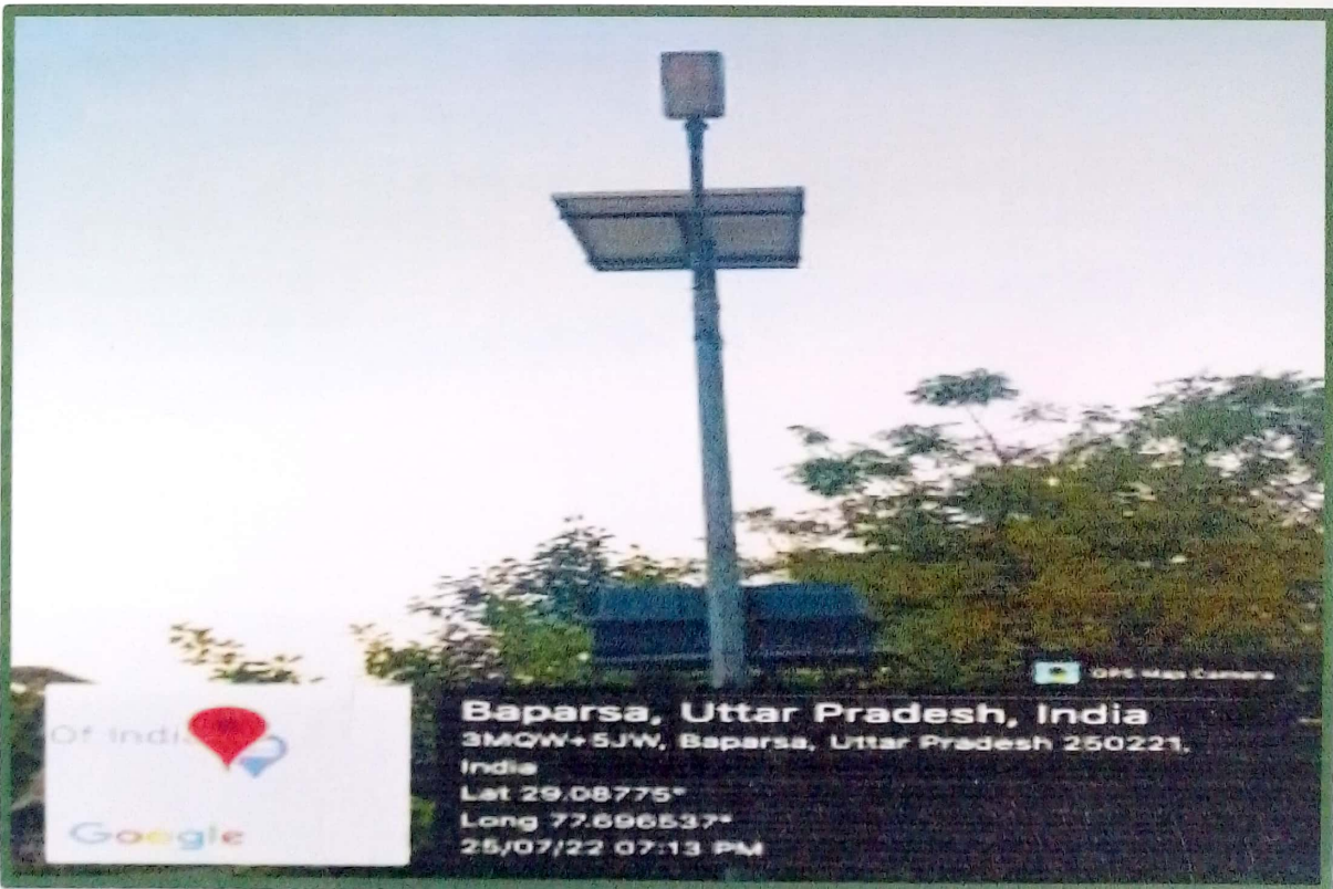
Sensor operated solar street lights in the university campus