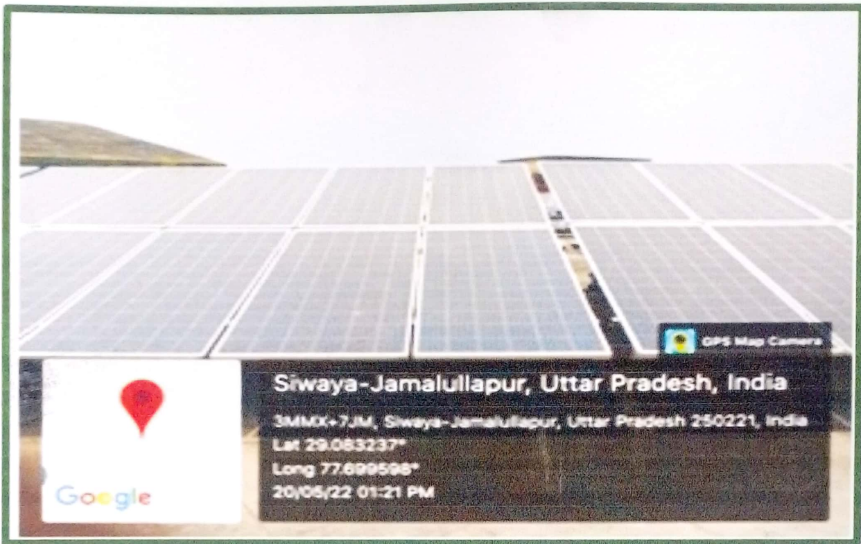
Solar panels installed on roof tops of university buildings