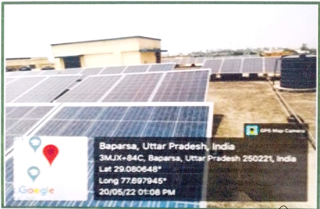
Solar panels installed on roof tops of university buildings